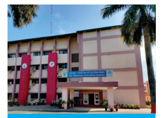
In this Issue