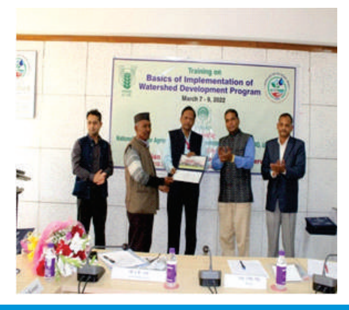
ICAR-IISWC , Dehradun