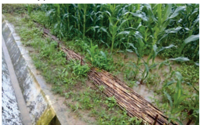
Application of Arundo donax mats in zero-tilled maize crop

The use of Arundo donax mats (10 cm thick) in zero-tilled maize crop at 0.50 m vertical interval (VI) on sloping crop lands in Himalayan foothills recorded effective reduction in runoff (8.5%) and soil loss (0.68 t ha<sup>-1</sup>) as compared to zero tilled maize crop grown without erosion controlling mats, (35-37% runoff and 4.7-5.5 t ha<sup>-1</sup> soil loss). With this conservation technique, most of the rain water got stored into soil profile which was useful for raising pea a catch crop in between rainfed maize-wheat crops without affecting wheat crop yield.